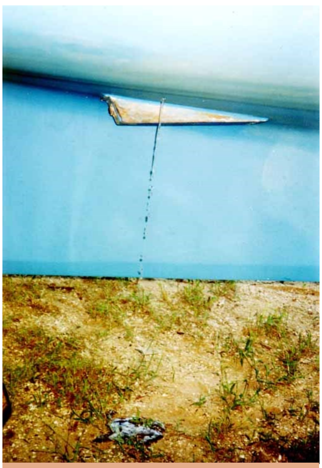
Water shooting out of the core of a 34-foot foam-core boat

If you think about it, a boat with a soggy wet core, poses a real conundrum for a moisture meter. If a boat has been