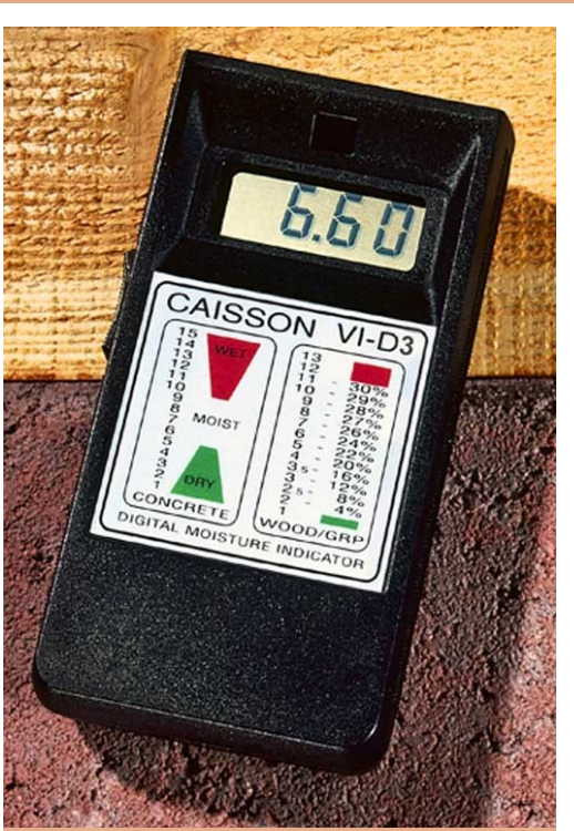
Novanex Caisson Moisture Meter

More amusing, is a larger British survey company, who had a woman surveyor. No mat-