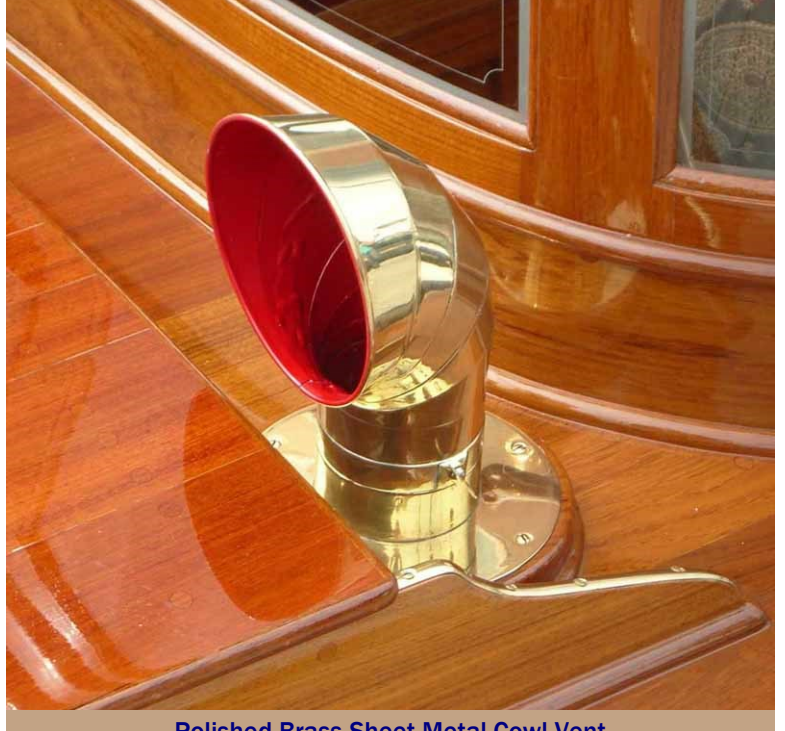
Polished Brass Sheet Metal Cowl Vent

If you don't like polishing bronze deck hardware (and don't want to just let it "go green," which is harmless) get it chrome plated. Now that's Bristol fashion! (This must be proper, marine-grade, high-quality chrome plating. Careful preparation over 2 or 3 nickel base coats, and multiple chrome coats are required. Cheap chrome plating will peel off and look awful in a very short time.) Phosphor and alu-