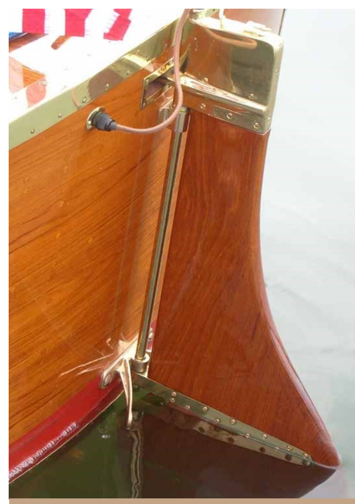
Bronze Rudder Stock, Rudder Stop, and Straps

There are some brasses which masquerade as bronzes, however. The four most common of these fakers are manganese bronze, Tobin bronze, commercial bronze, and naval brass. Manganese bronze is a complete misnomer (though it is the correct name for some unknown reason). In fact, manga-