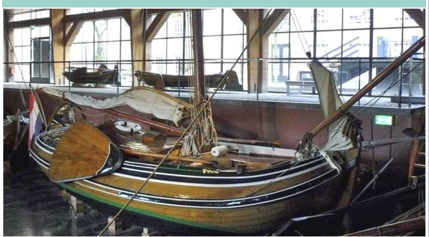
Sperwer (Sparrow Hawk) 31 ft. (9.5 m) LOA - 27 ft. (8.3 m) WL - 10 Tons - 1,000 sq.ft. (93 sq.m) Sail Area