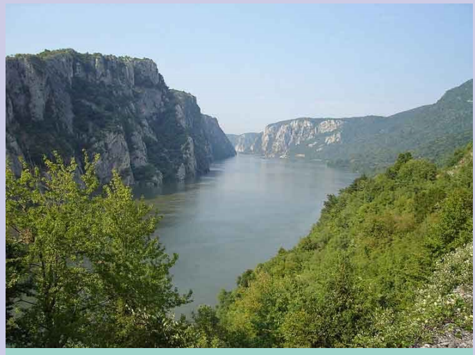
The Iron Gates gorge on the Danube

Ultimately, the plan to sink boats in the Danube was abandoned because the Germans apparently siphoned the fuel out of the boats of Minshall's little fleet. The small flotilla ran dry, and—dead in the water—they and Minshall's men were captured. Minshall escaped in his launch, which was following behind. Filling the launch with explosives, he then ran it at top speed into a rail-