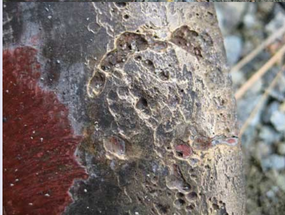
Severely Corroded Bronze Propeller