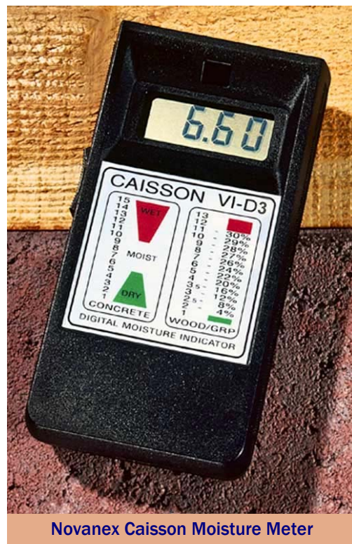
Novanex Caisson Moisture Meter

The "salts" we're referring to are not simple table salt (Sodium Chloride) found in sea water. Chemically, salts are a vast array of ionic compounds created during the total or partial neutralization of acids. Salts can also be created by