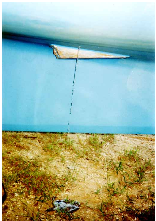
Water shooting out of the core of a 34-foot foam-core boat

If you think about it, a boat with a soggy wet core, poses a real conundrum for a moisture meter. If a boat has been