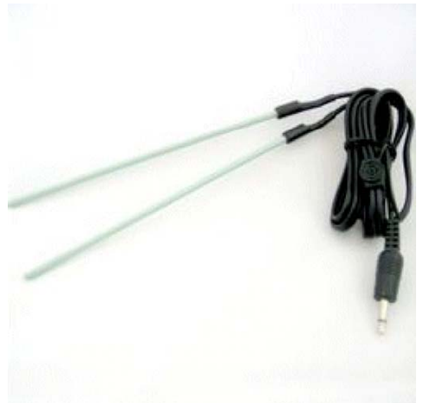
Protimeter Deep-Wall Probes

The Protimeter Mini and the Protimeter Surveymaster SM are two small hand units that can plug in long-pin, wall-type resistance pin probes.