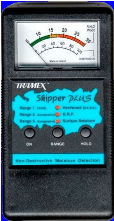
Tramex Skipper Moisture Meter

A foam-cored 34-footer (10.4 m) was brought in to one of my builders for repairs. Water had migrated remarkably efficiently through fastening holes and along improper open channels left by unfilled kerfs in the core. Nearly the entire hull shell—from keel to sheer—was flooded with water. Hauled out, water literally shot out of test holes we drilled in its bottom. One hole alone filled a 1-gallon (3.2 l) coffee can three-quarters full in just a few minutes.