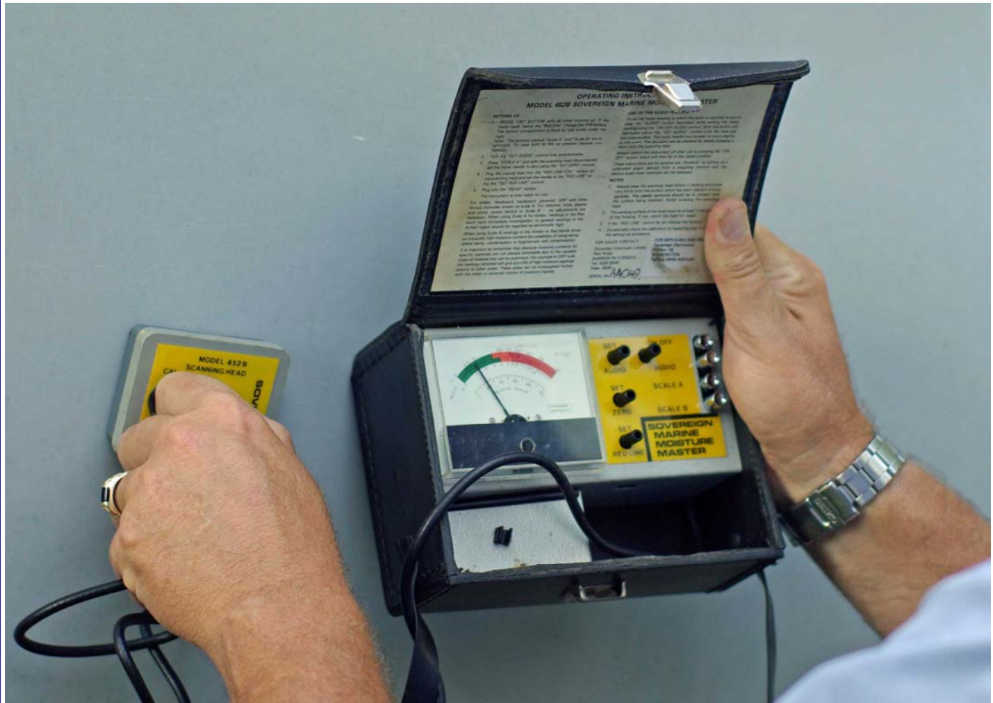
Sovereign Moisture Meter

In fact, you should always specify the make and model of the meter, and the scale used for the reading in your report. There is a large difference between the scales used on dif-